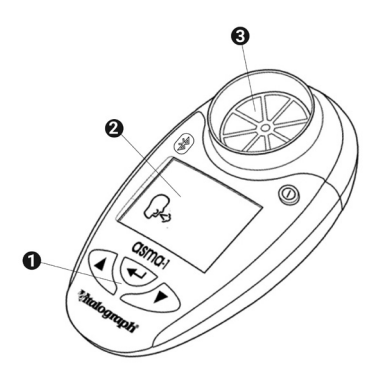
Figure 1 Vitalograph asma-1 BT Components