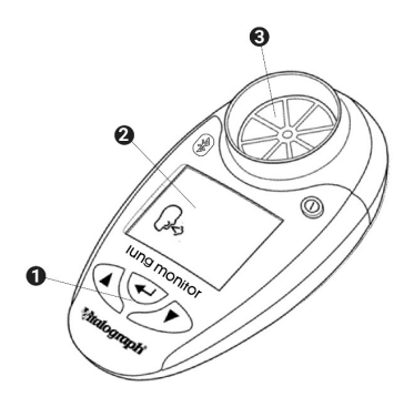
Figure 1 Vitalograph Lung Monitor BT Smart Components